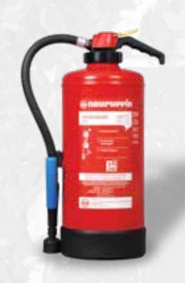
Cartridge-operated extinguisher WA 9 F-500

Comprehensive testing was conducted on an E-scooter 182-cell battery (cell type 18650), a larger battery size than those generally used in devices such as mobile phones, laptops, power tools, gardening tools, model sports (e.g., remote-controlled cars, boats, drones), and E-bicycles (which can use 48-cell batteries). Neuruppin created two different portable 9L extinguisher models lithium-ion batteries up to the tested battery type with 1890 Wh (51.1 V / 37 Ah).