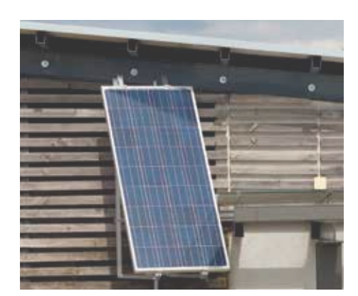
Solar storage for homes (magnitude 4-5kWh)