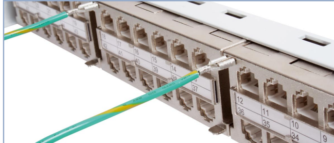
Individual fault tolerant grounding concept for every 12-port module